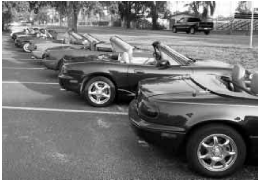
Even from the rear, the Miatas look good! Kinda like...I won't go there...

At our special November meeting, we had some very nice prizes donated by generous vendors and some lucky winners: