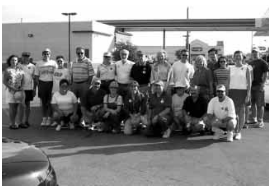
A bunch of hungry looking Sun Riders getting ready for the Dinner and a Movie run.