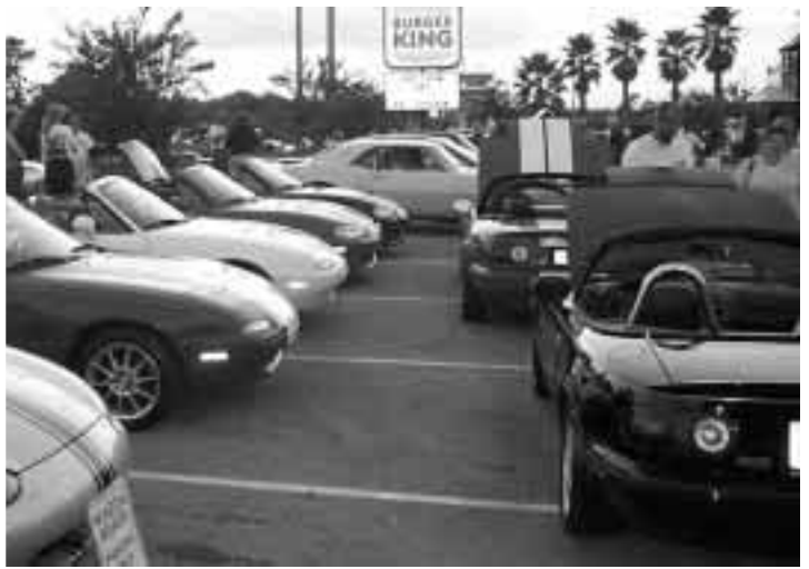
A couple of shots from the Burger King Car Show. I heard a bunch of the other clubs were pretty jealous...