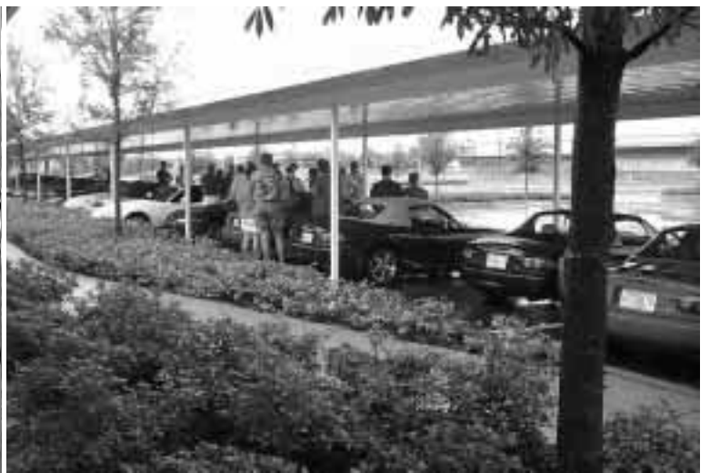
Rain it did... And some hail, the adventurers took shelter under the covered parking spaces at the Tampa Port Authority meeting place.