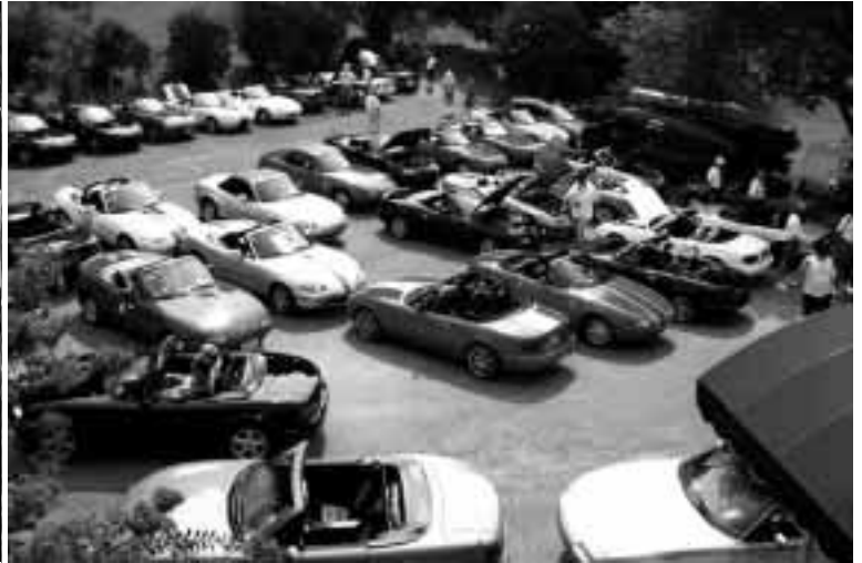
A bunch of Miatae at the Gap. If you want to see what other

people spend on their cars, you gotta go!