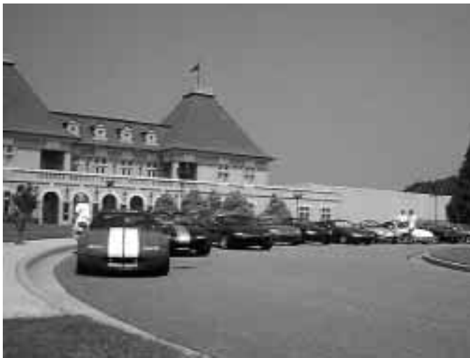
Some Sun Riders stopped at the Chateau Elan Winery for lunch on the way up... Pretty place!