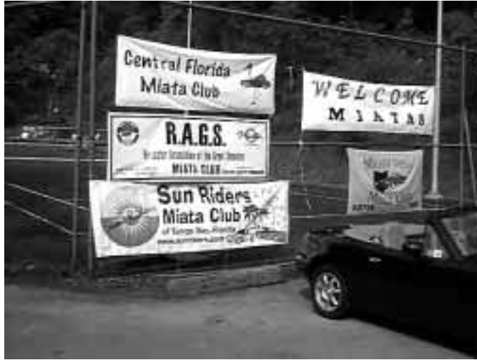
Which Club had the biggest banner... Huh?