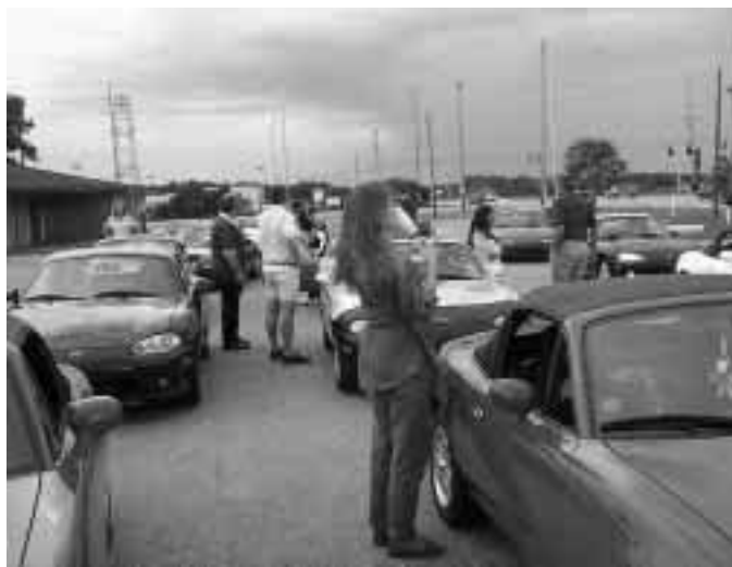
We regrouped at Sun City Center for the last stage of the tour. It looked like it was clearing, and many Sun Riders put down their tops.