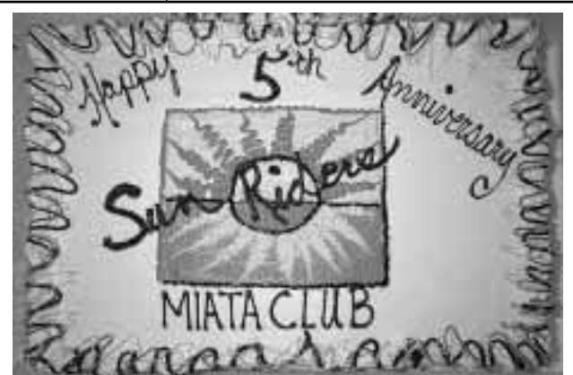
Our 5th anniversary cake

Tuesday, December 19th - 6:30 PM kick the tires - 7:00 PM dinner and meeting.