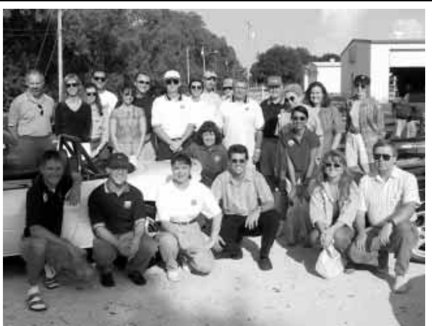
Getting ready for the run to Safety Harbor. Dine & Drive September 23.

rich history, even in it's 5 short years. The very first event was a scavenger hunt (as reported in the first newsletter), then came a "Drive in the Country", a Dine & Drive, a Halloween Costume Party, and a "Weekend in Savannah" all in the first 4 months of existence!