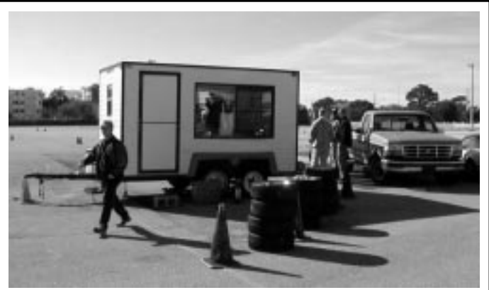
The Club's new Timing-Shack-On-Wheels in action at the January 20-21 Autocross Clinic and Autocross

recently replaced her '99 black and tan was washed for Christmas.