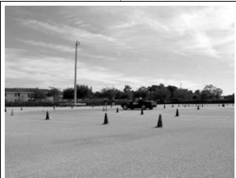
Don Reese at the January Autocross

attend these events need to get out and help when ever possible, there is a lot of work to setup and tear down the course.