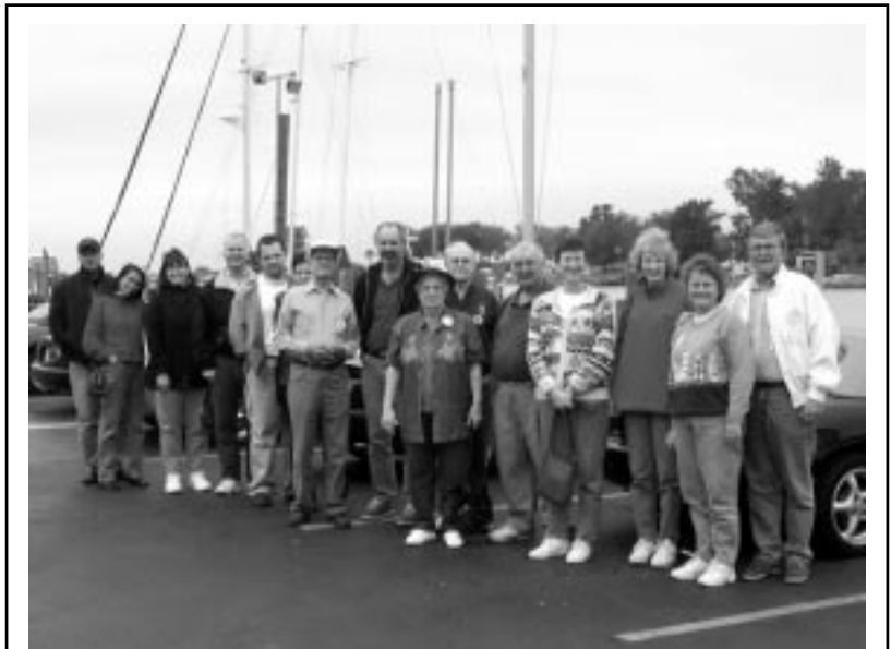
Smiles and jackets (and sweaters) except for a few at the "Miatas of Venice" tour on February 3rd. It did get a little chilly!