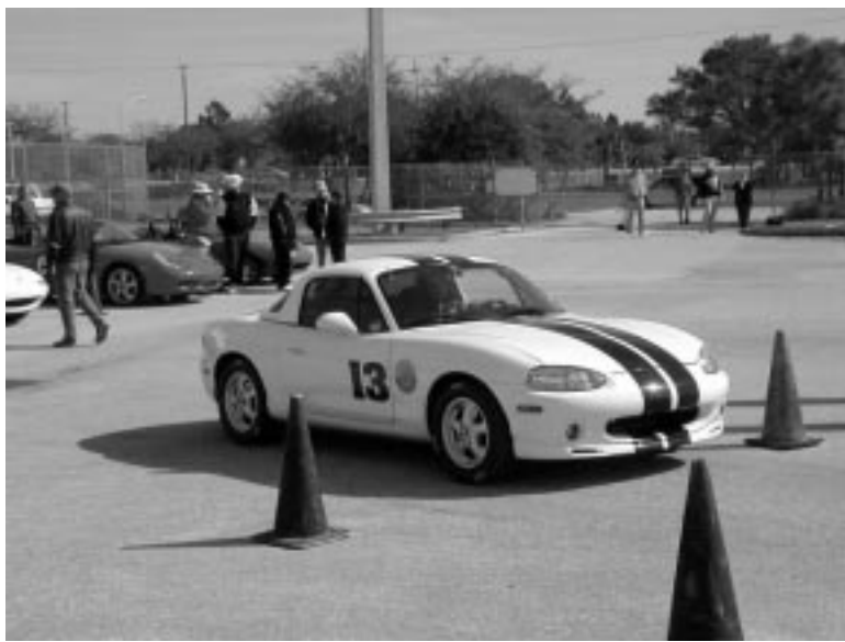
Bill Bullington at the January Autocross