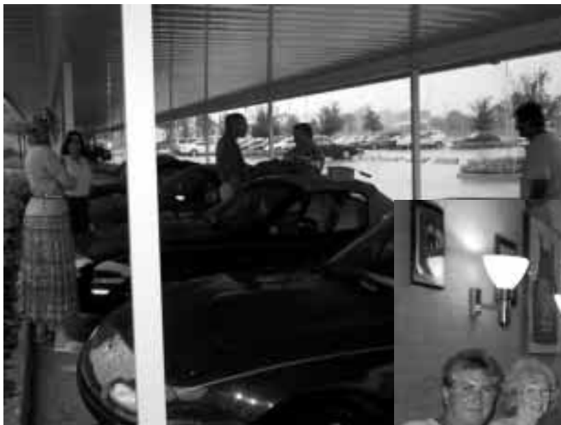
Above: Waiting for the rain to stop... It didn't, and infact, got worse!