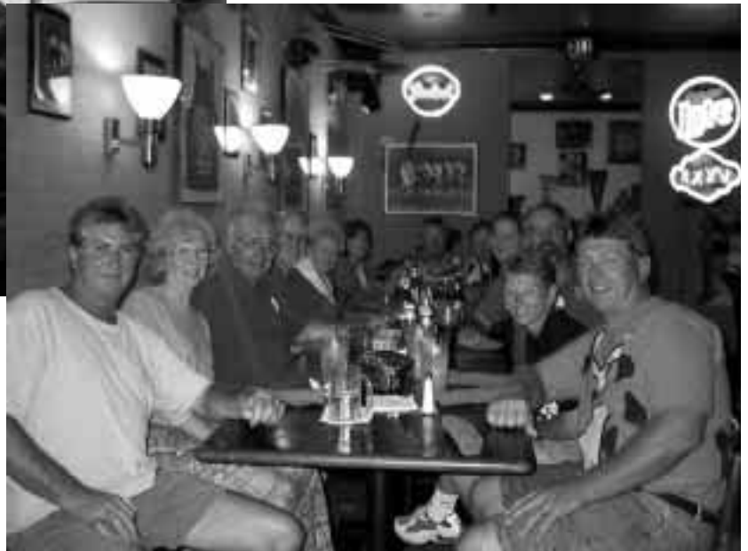
Below: The group enjoys a great meal at the Sports bar at the Wyatt-Wyndom after braving flooded Tampa streets.